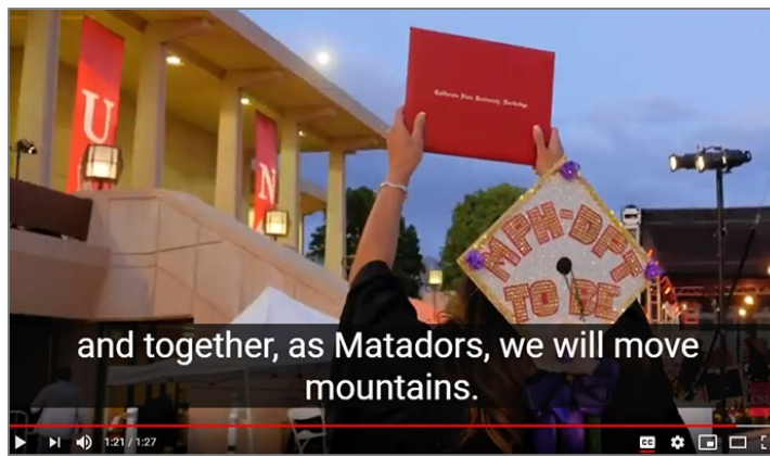
Student holds a diploma hardcover up in the air during CSUN commencement. Caption text "and together, as Matadors, we will move mountains."