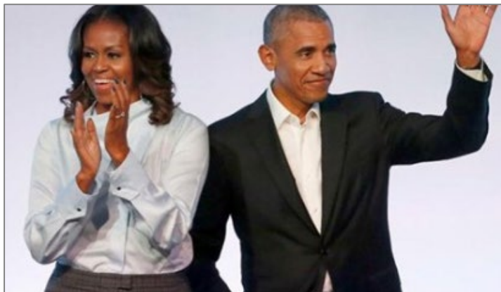
Michelle Obama claps and Barack waves.