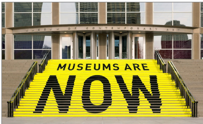
A stair chase leading up to an entryway is painted yellow with bold black text that reads museums are now.