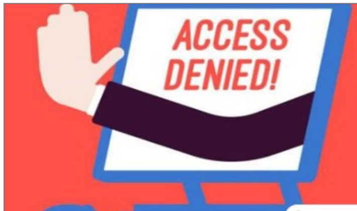
A hand reaches out of a computer screen giving the hand gesture for stop. The screen reads 'access denied!'