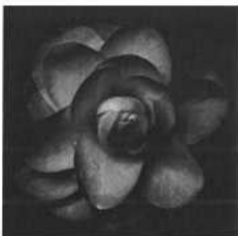
Figure 1: A black and white photo of a camellia

Information conveyed in images needs to be conveyed in text as well. This can be done either through alt text as in the color wheel image above, or by using captions. When using captions, the author may want to artifact the image (set as background) so that the screen reader isn't reading duplicative information.