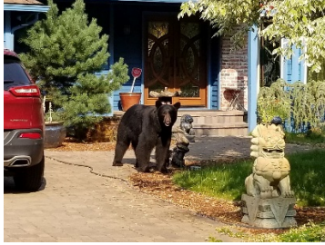
Figure 2: A new neighbor comes to visit